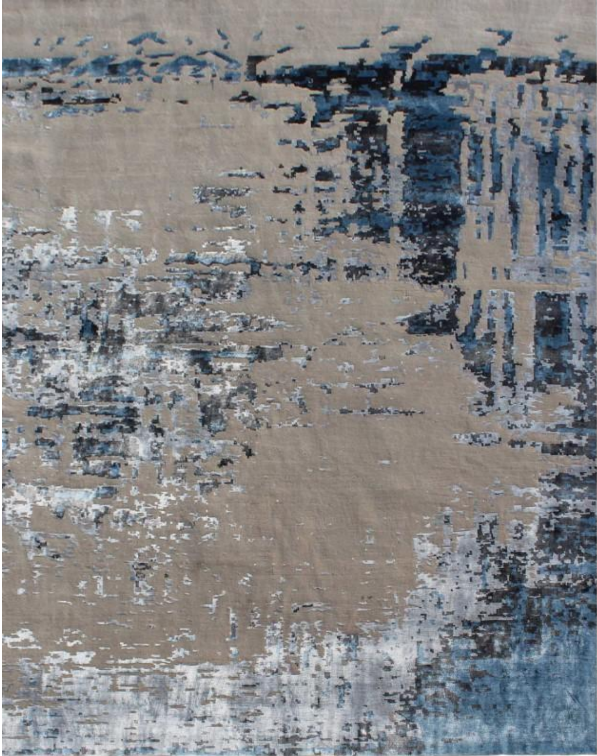
Indo Tibetan wool/silk 8x10 ft